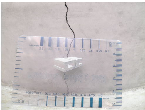
Crack width \approx 1,000 \mu\text{m} (1 mm)